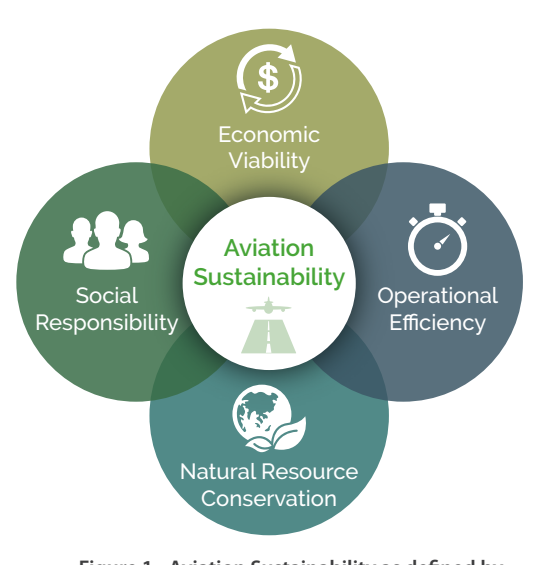
Figure 1 - Aviation Sustainability as defined by Airports Council International - North America

The purpose of this update is to assess progress and further elevate sustainability across the system of airports. The Aviation Sustainability Plan - 2020 Update (Update), builds