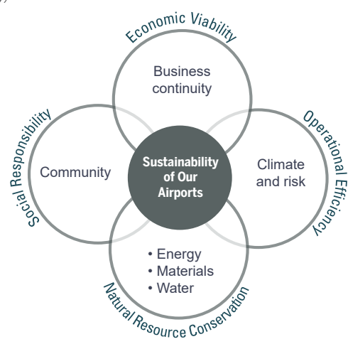
Figure 2 - Public Works Aviation Sustainability Focus Areas

flexibility paid off, as Public Works has been able to prioritize measures that make sense regardless of the situation while still contributing to their sustainability objectives.